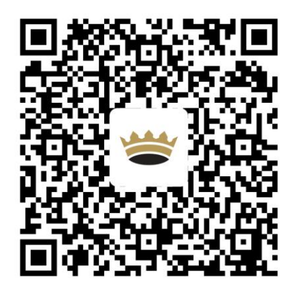
Scan the QR code to find out more information about this property.

Disclaimer Property Details: These particulars, whilst believed to be accurate are set out as a general outline only for guidance and do not constitute any part of an offer or contract. Intending purchasers should not rely on them as statements or representation of fact, but must satisfy themselves by inspection or otherwise as to their accuracy. We have not carried out a detailed survey nor tested the services, appliances and specific fittings. Room sizes should not be relied upon for carpets and furnishings. The measurements given are approximate. No person in this firms' employment has the authority to make or give any representation or warranty in respect