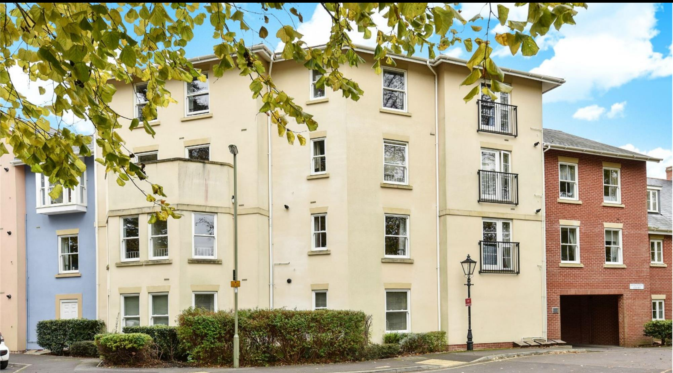
Ashbourne Court, Winton Close, Winchester, Hampshire, SO22 6DJ