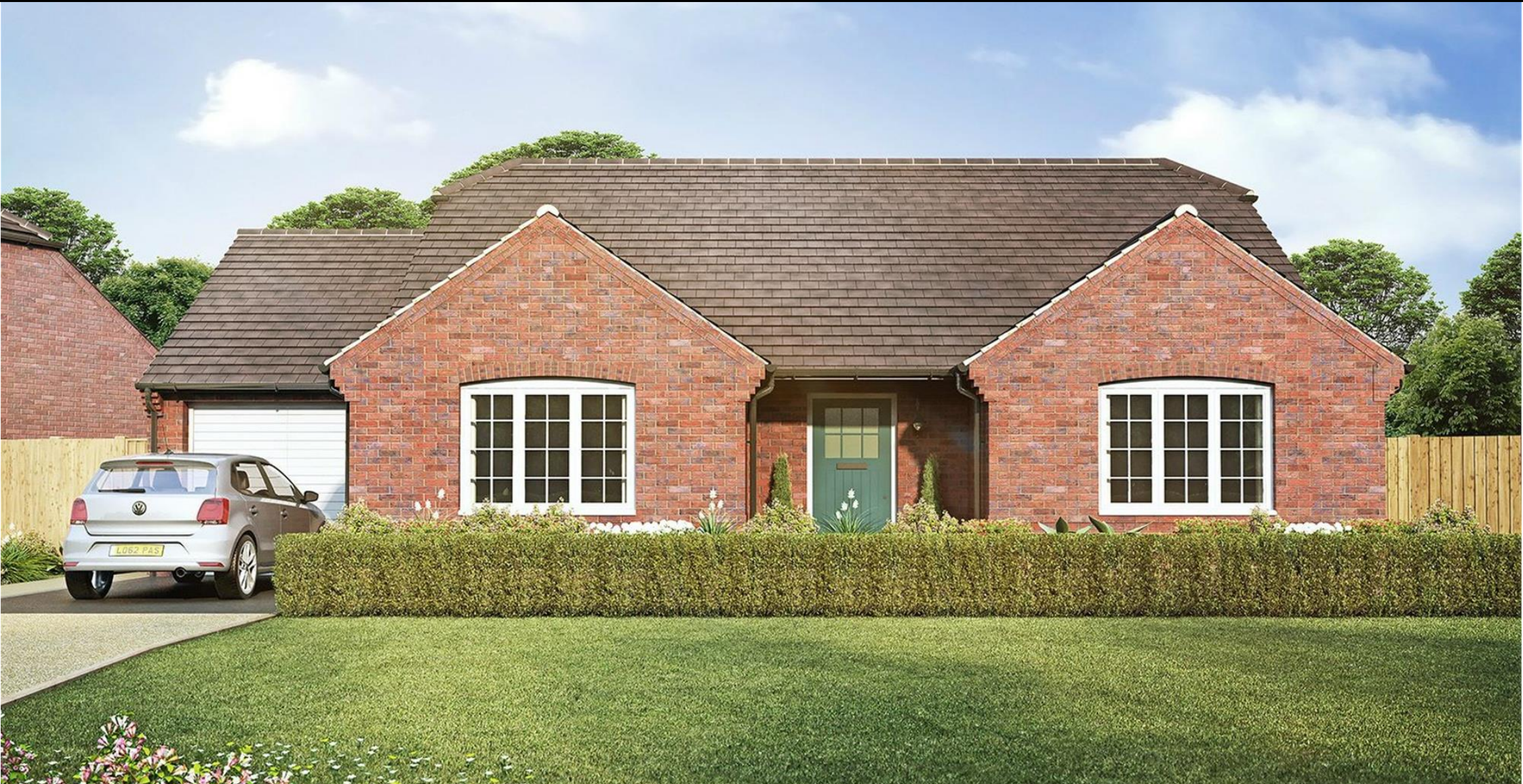
Plot 45 The Buckthorn, Ashwood, Boyneswood Lane, Medstead, Alton, Hampshire, GU34 5DZ