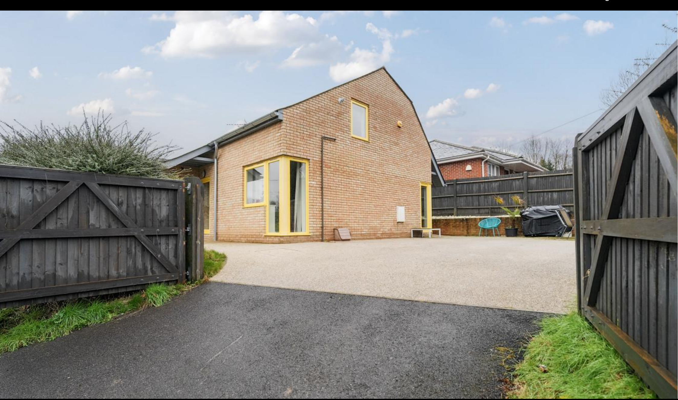
Springvale Road, Winchester, Hampshire, SO23 7LF