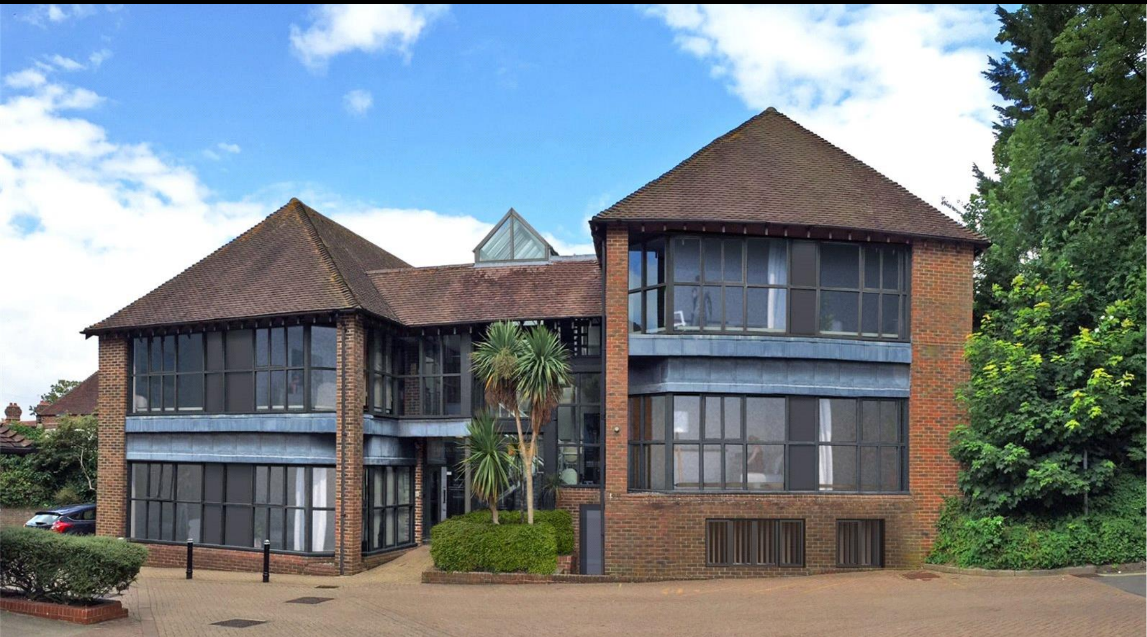
Capitol House, Bridge Street, Winchester, Hampshire, SO23 0HL