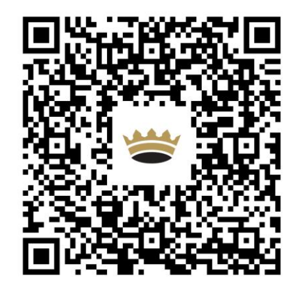
Scan the QR code to find out more information about this property.

Disclaimer Property Details: These particulars, whilst believed to be accurate are set out as a general outline only for guidance and do not constitute any part of an offer or contract. Intending purchasers should not rely on them as statements or representation of fact, but must satisfy themselves by inspection or otherwise as to their accuracy. We have not carried out a detailed survey nor tested the services, appliances and specific fittings. Room sizes should not be relied upon for carpets and furnishings. The measurements given are approximate. No person in this firms' employment has the authority to make or give any representation or warranty in respect of the property.