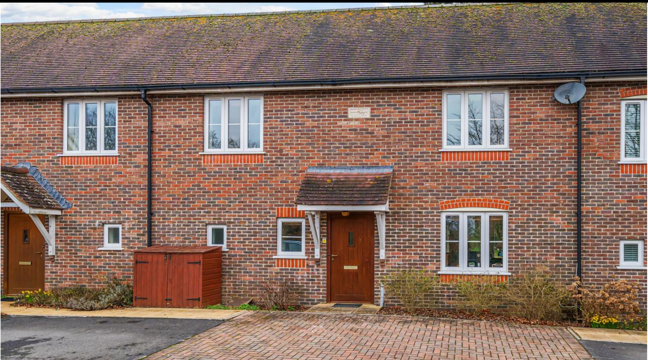
Lupin Gardens, Winchester, Hampshire, SO22 5AF