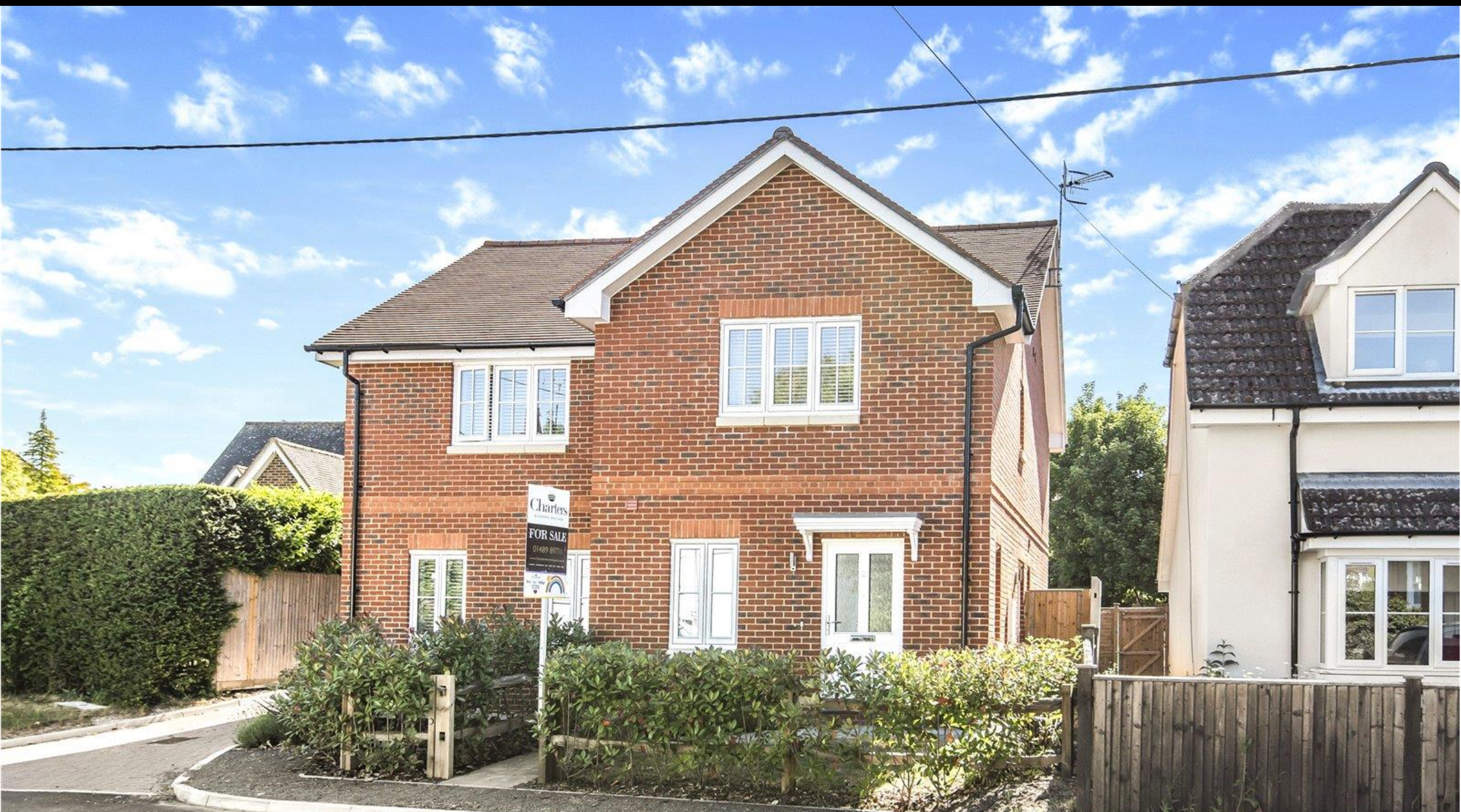
Houghton Cottages, Warnford Road, Corhampton, SO32 3ND