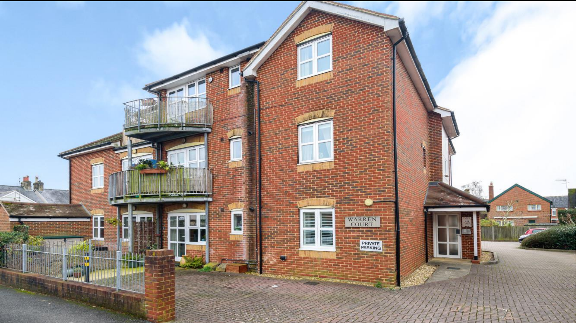
Warrens Court, Ackender Road, Alton, Hampshire, GU34 1JT