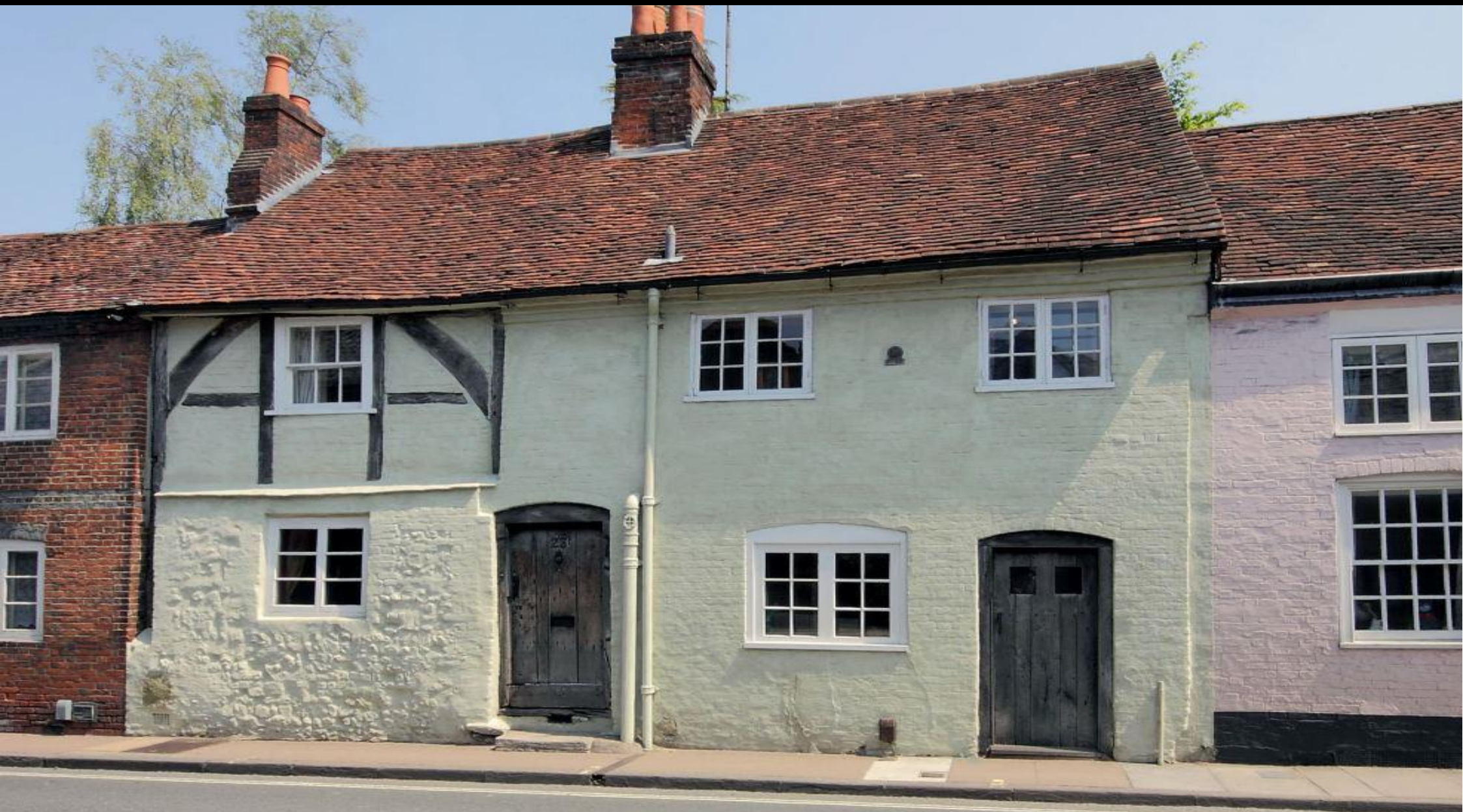
Chesil Street, Winchester, Hampshire, SO23 0HU