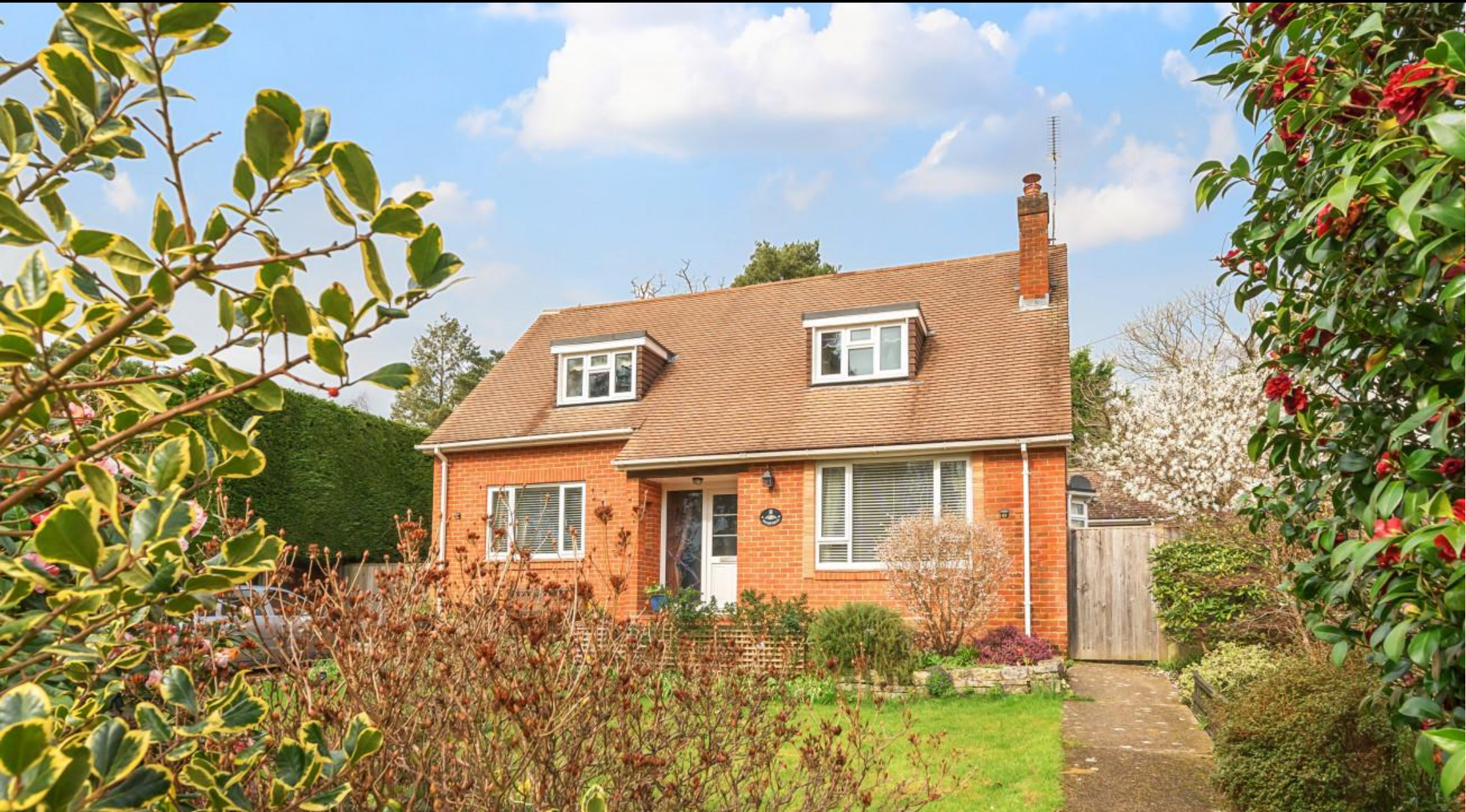
Heatherdene Road, Chandler's Ford, Hampshire, SO53 5BN