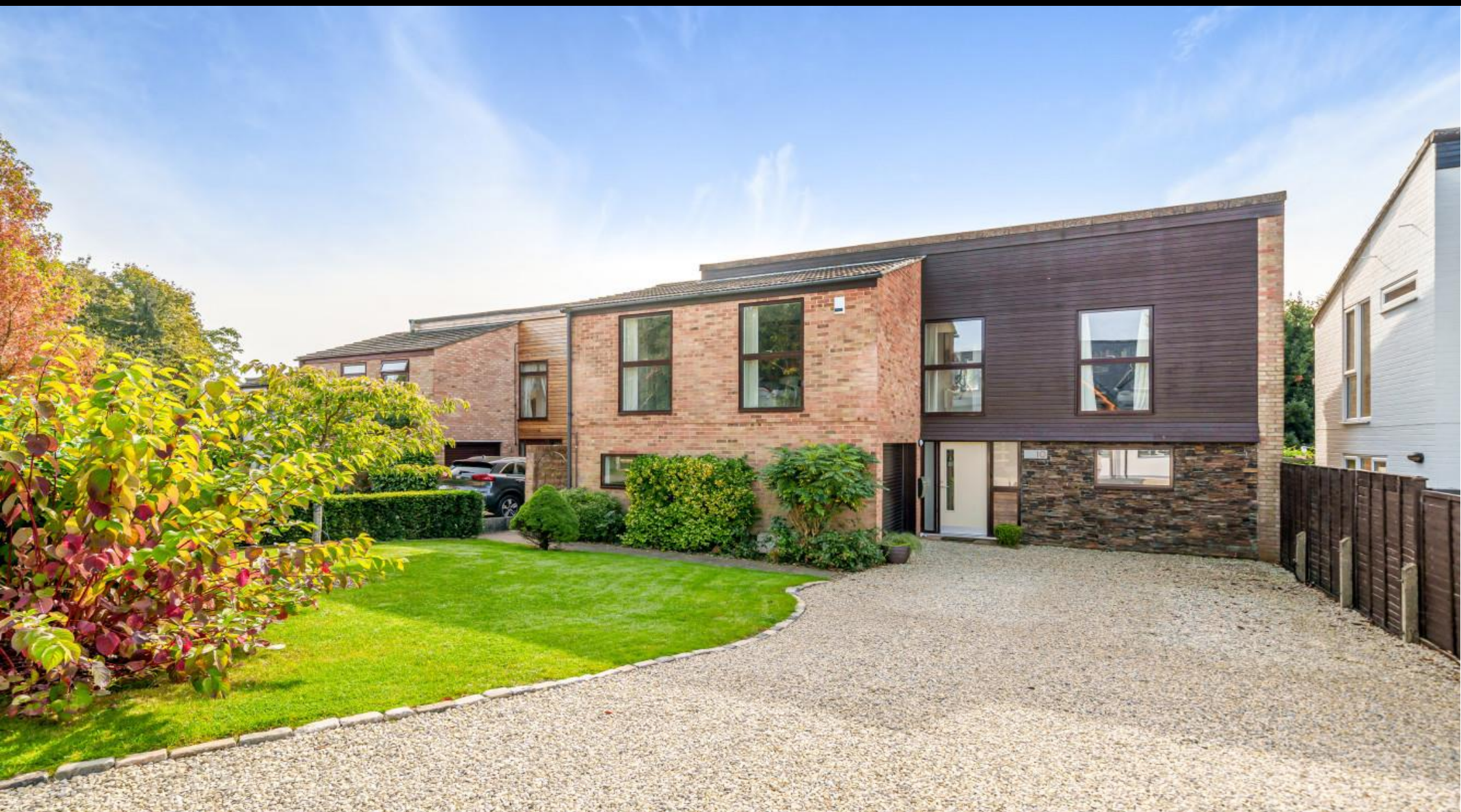
Olivers Battery Gardens, Winchester, Hampshire, SO22 4HF