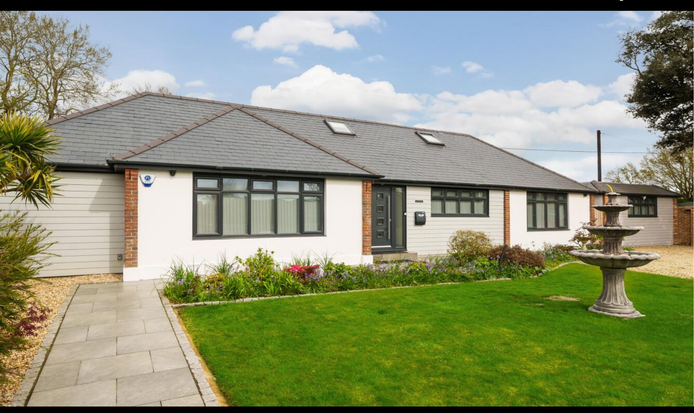
Toogoods Way, Nursling, Southampton, SO16 0XL