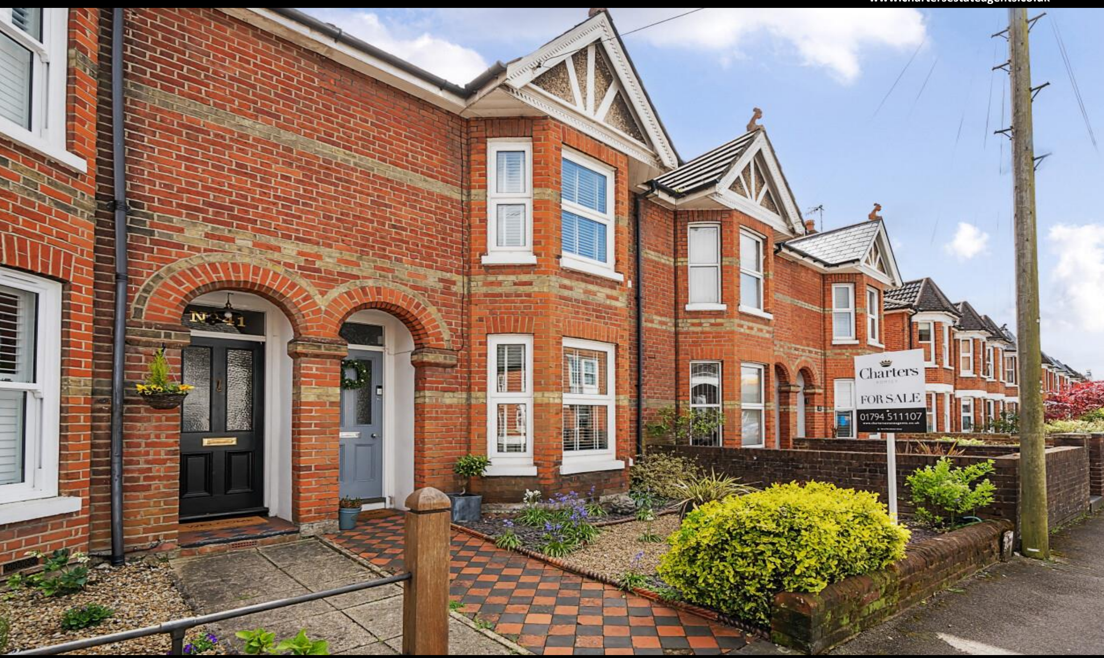
Winchester Road, Romsey, Hampshire, SO51 8AB