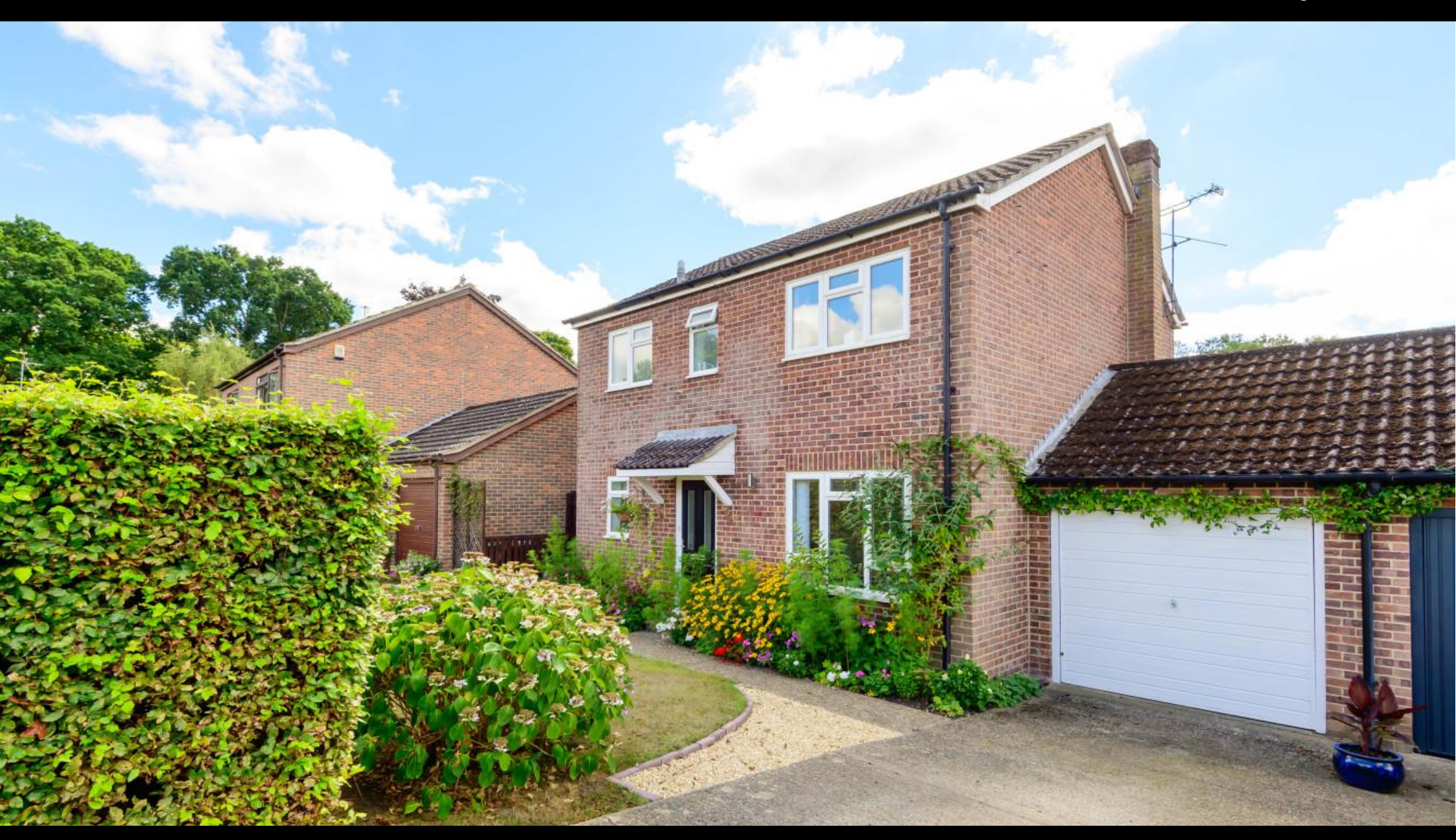
Lodge Vale, East Wellow, Romsey, Hampshire SO5 I 6AU