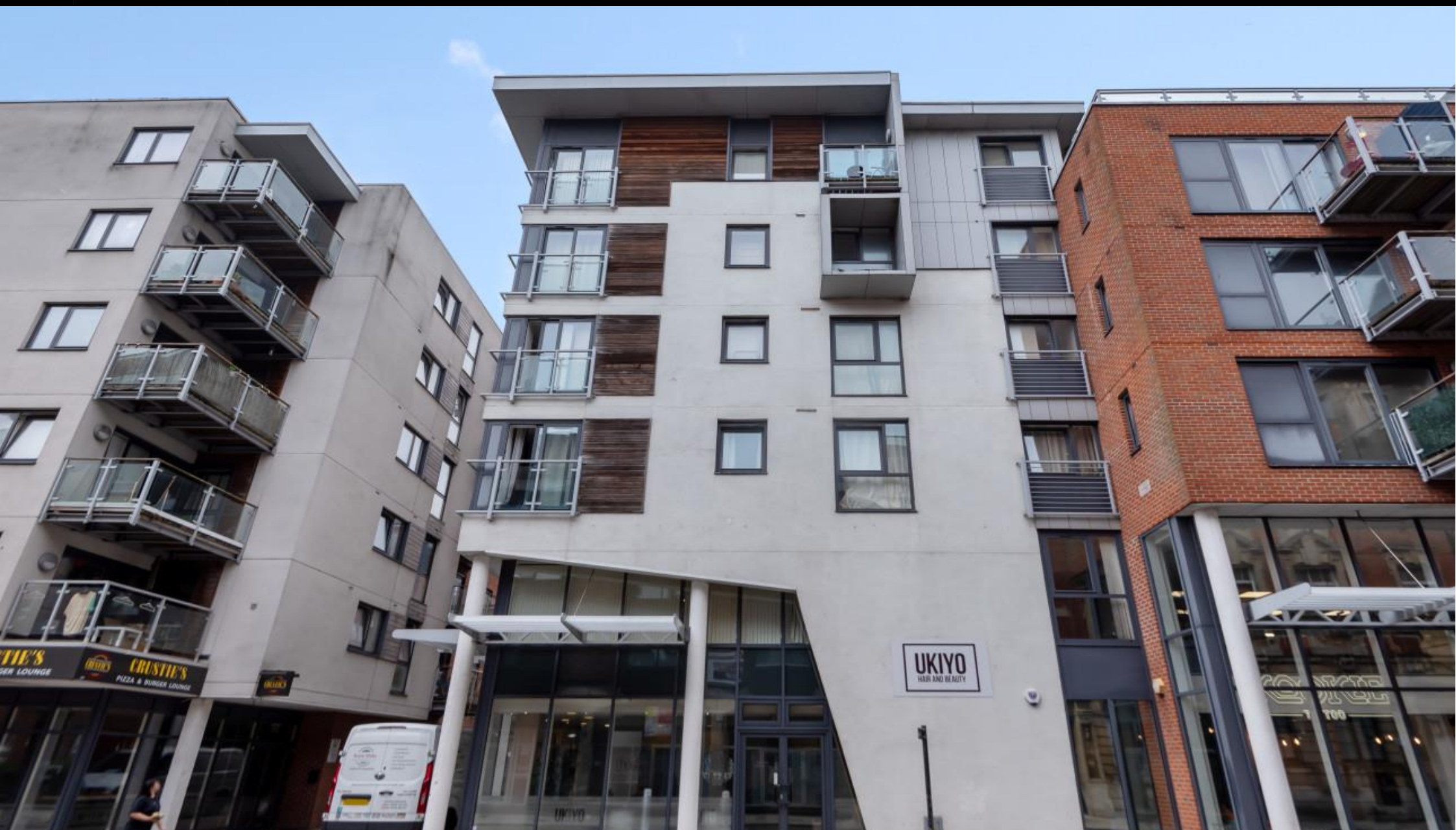
Kimber House, High Street, Southampton, SO14 2EB