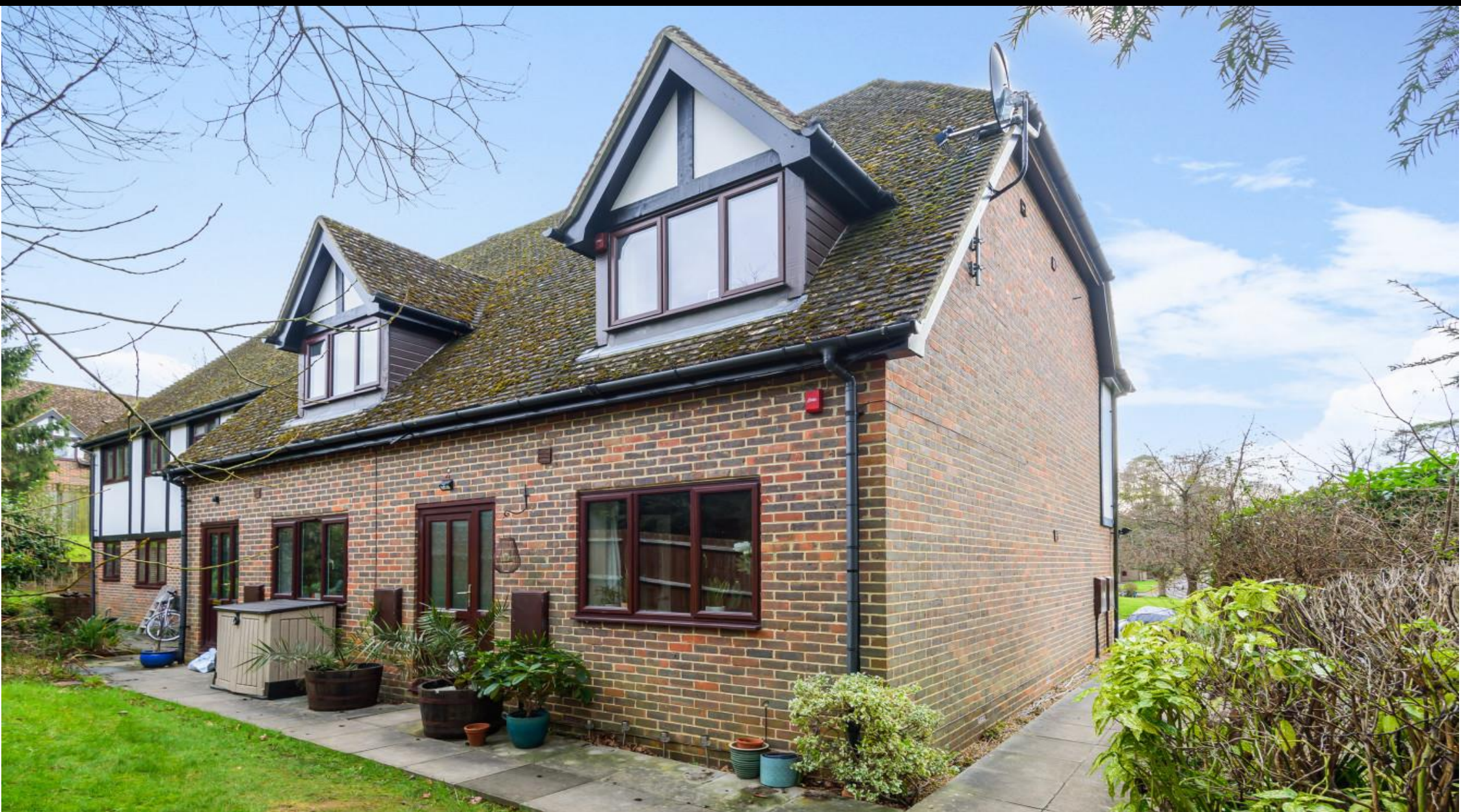
Broad Ha'penny, Wreclesham, Farnham, Surrey, GU10 4TF