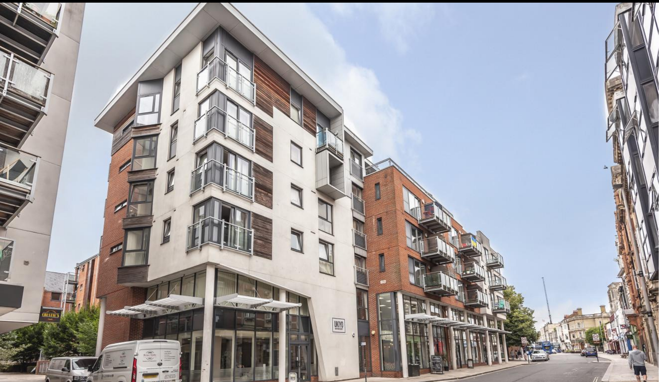
Kimber House, 118 High Street, Southampton, Hampshire, SO14 2EB