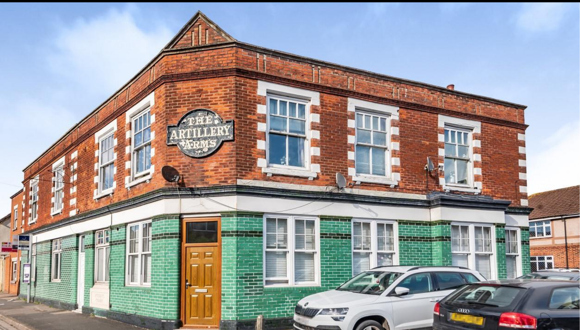
Woody Court, Brockhurst Road, Gosport, Hampshire, PO12 3BB