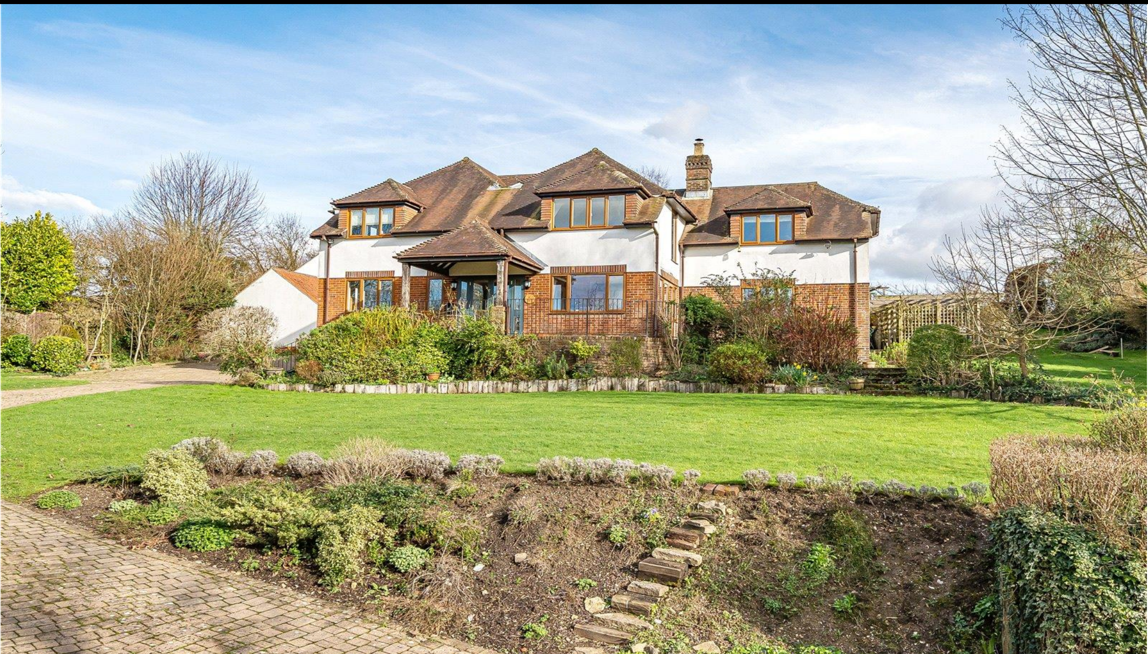
Chalk Hill, Soberton, Hampshire, SO32 3PH