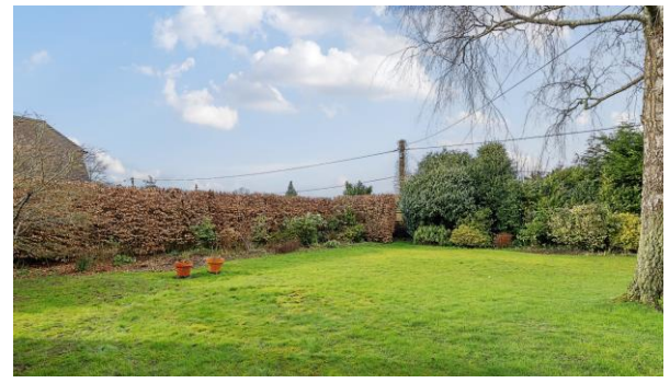
East Hampshire District Council Council Tax Band: G