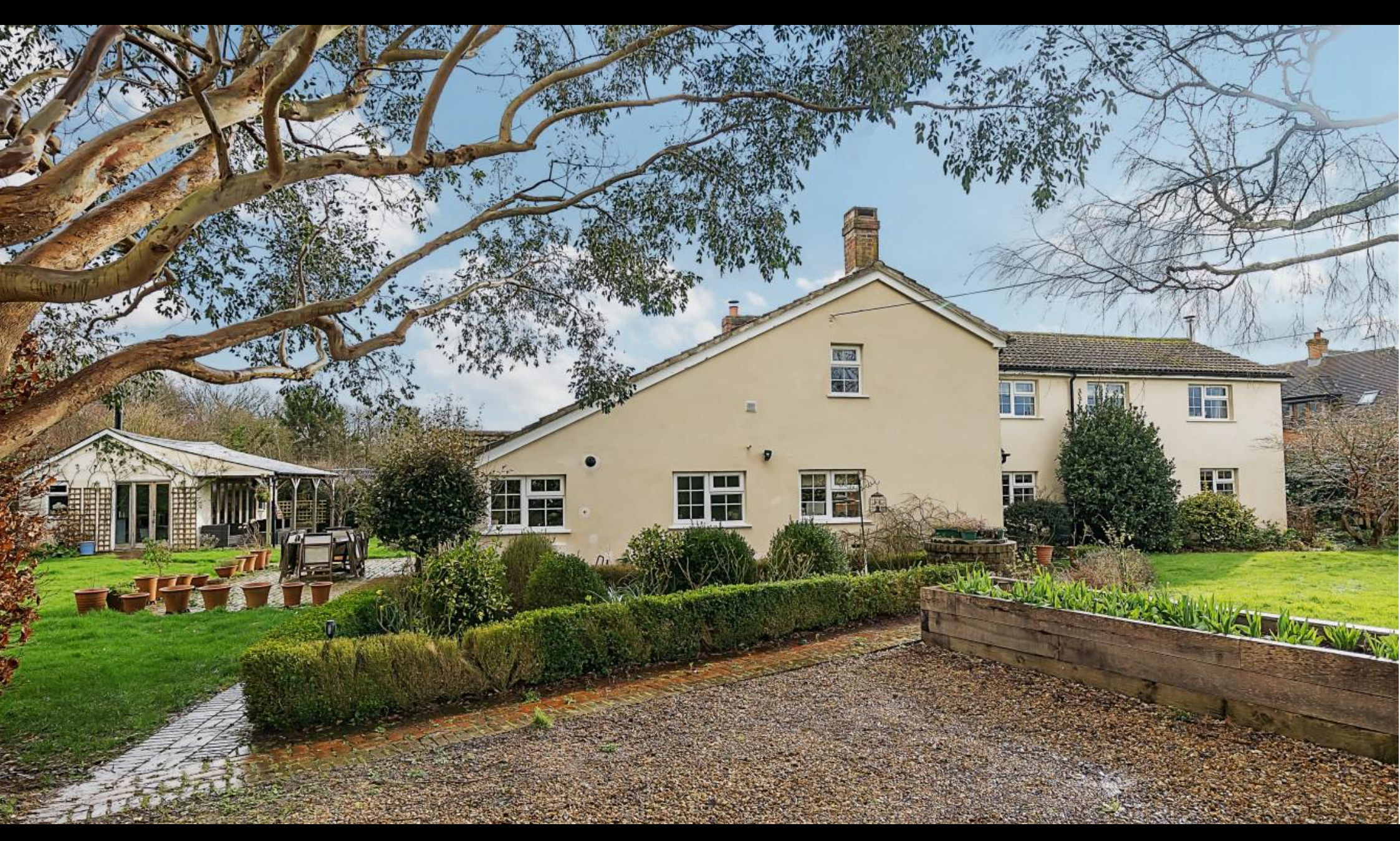
Soldridge Road, Medstead, Alton, Hampshire, GU34 5JF