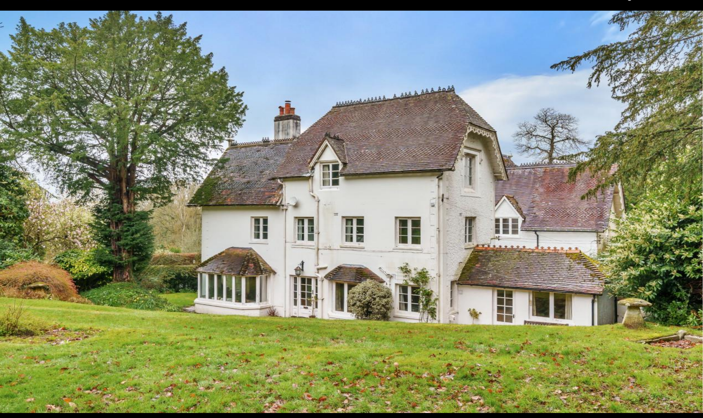
Winchester Road, Shedfield, Hampshire, SO32 2JA