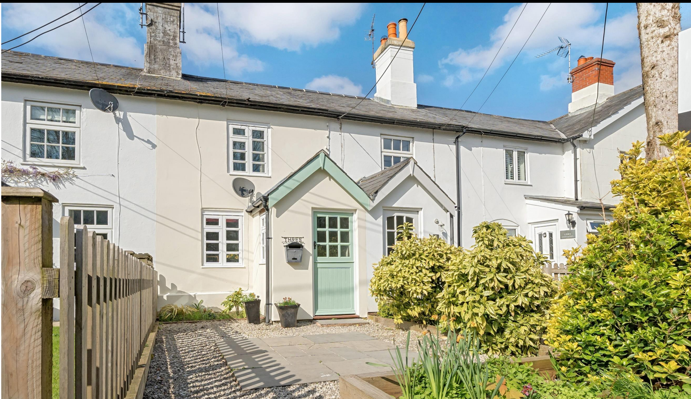
Links Cottages, Tichborne Down, Alresford, Hampshire, SO24 9PA