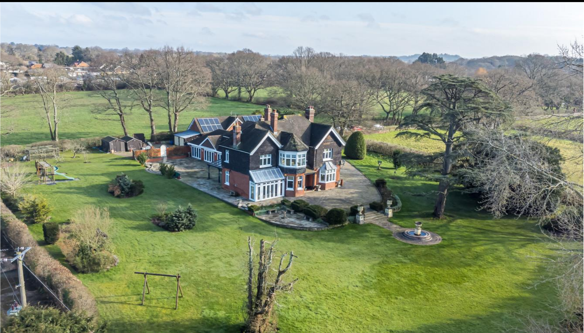
New Inn Road, Bartley, Southampton, Hampshire, SO40 2LR