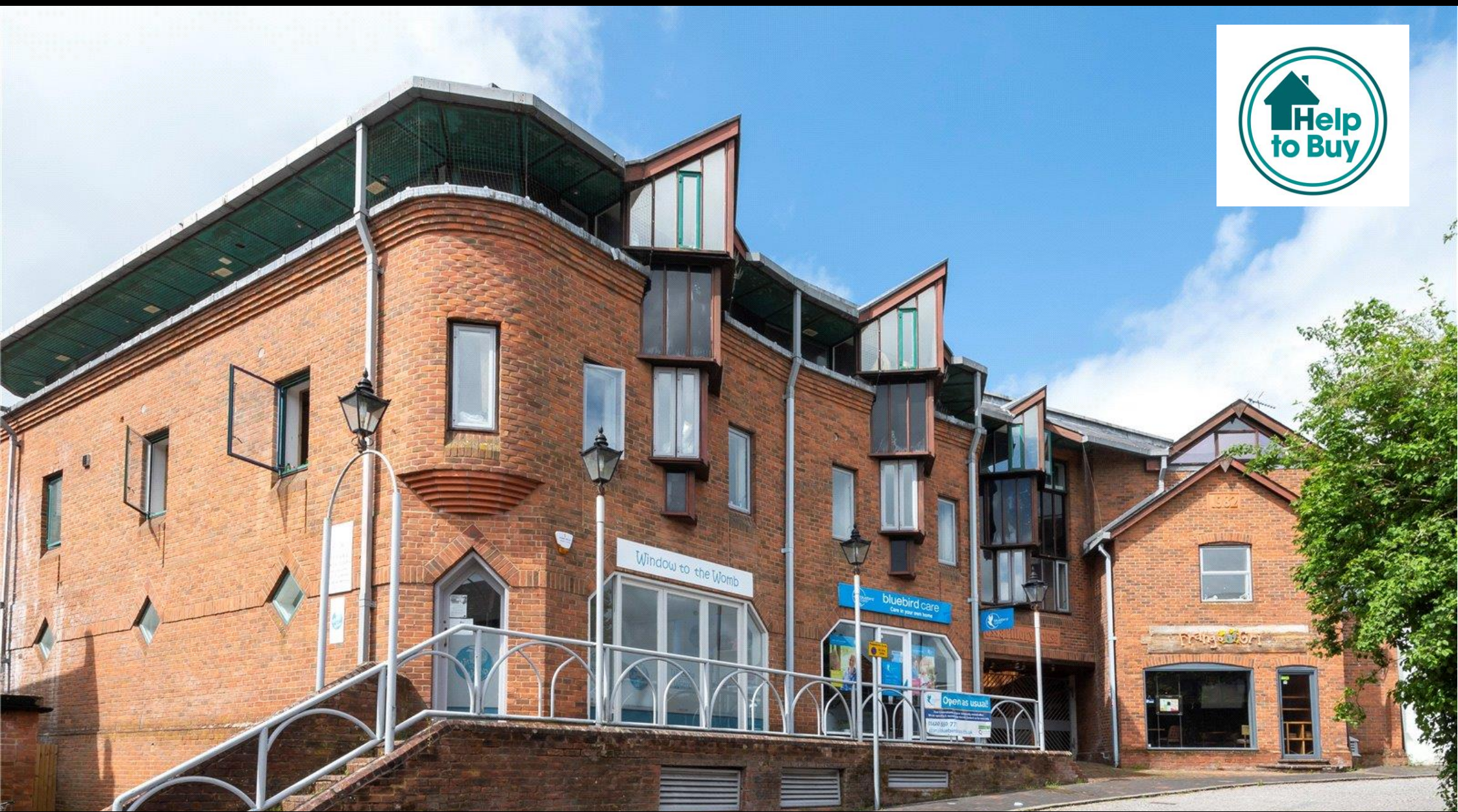
Apartment 10, Cross & Pillory House, 1A Cross & Pillory Lane, Alton, Hampshire, GU34 1HL