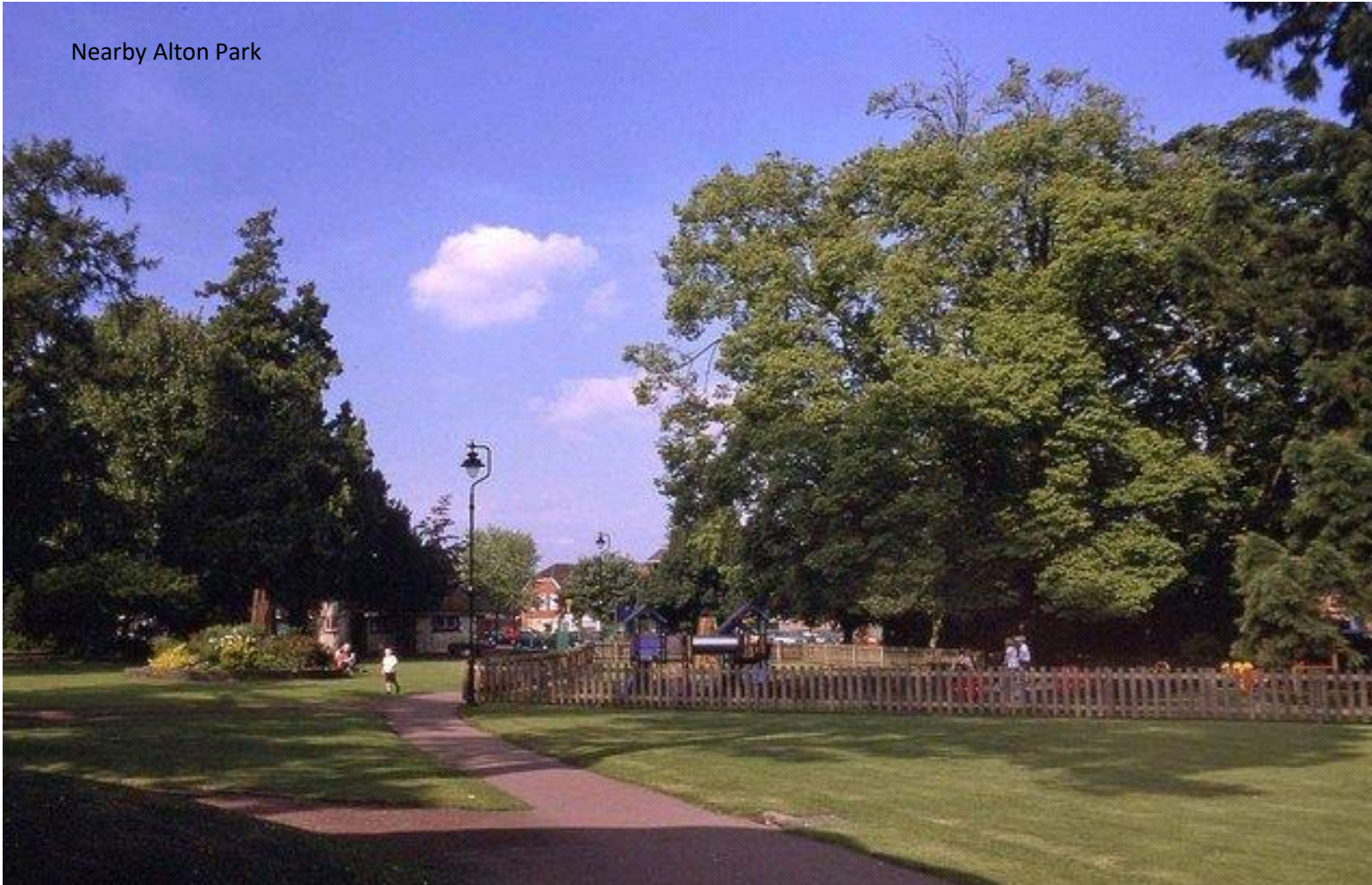
Nearby Alton Park