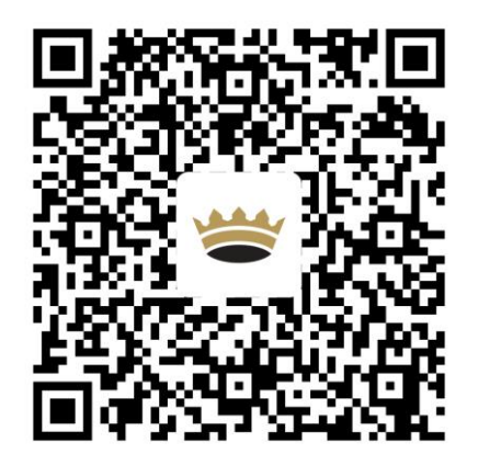
Scan the QR code to find out more information about this property.

Disclaimer Property Details: These particulars, whilst believed to be accurate are set out as a general outline only for guidance and do not constitute any part of an offer or contract. Intending purchasers should not rely on them as statements or representation of fact, but must satisfy themselves by inspection or otherwise as to their accuracy. We have not carried out a detailed survey nor tested the services, appliances and specific fittings. Room sizes should not be relied upon for carpets and furnishings. The measurements given are approximate. No person in this firms' employment has the authority to make or give any representation or warranty in respect