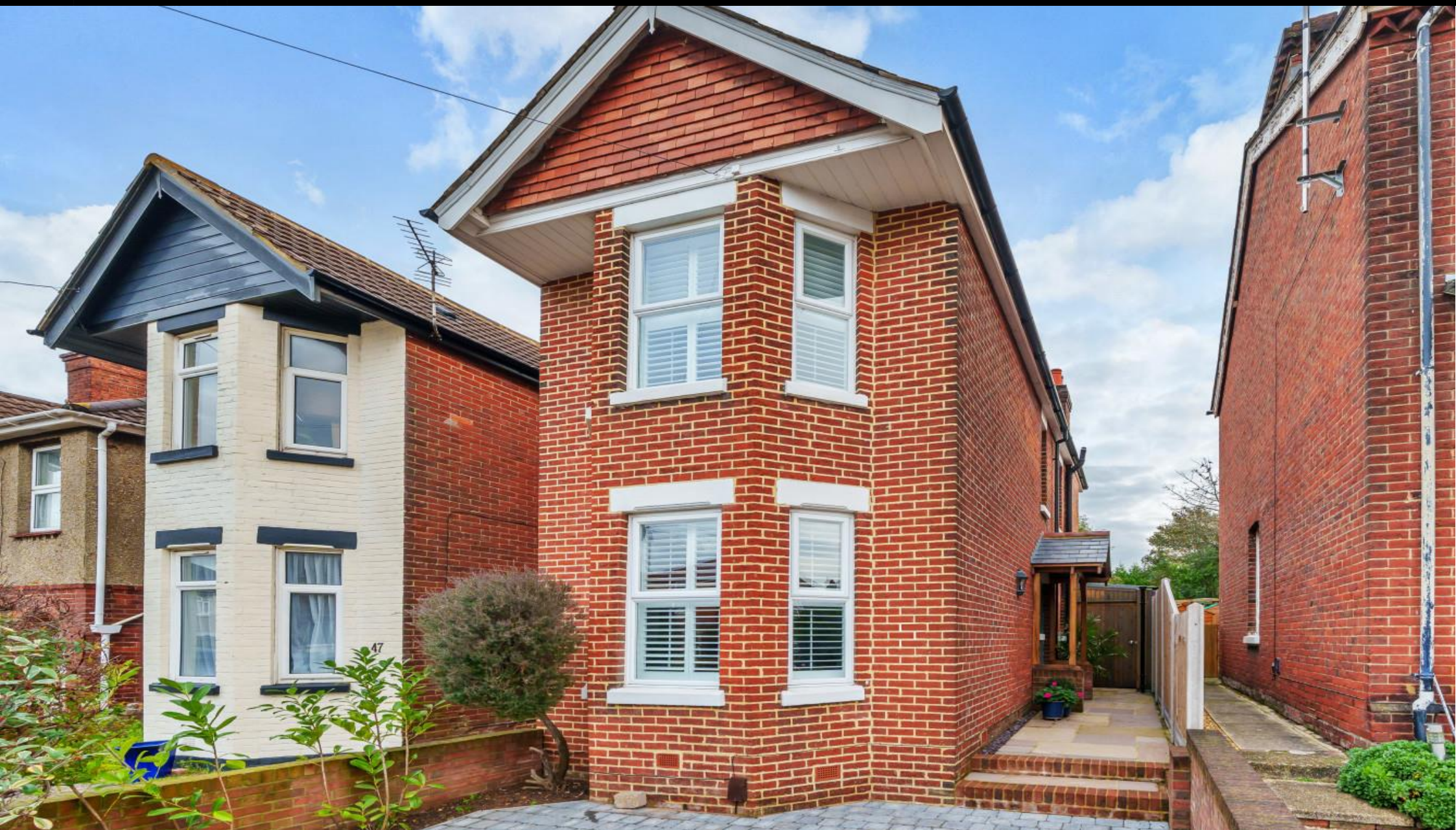
Chafen Road, Bitterne Manor, Southampton, Hampshire, SO18 1BD