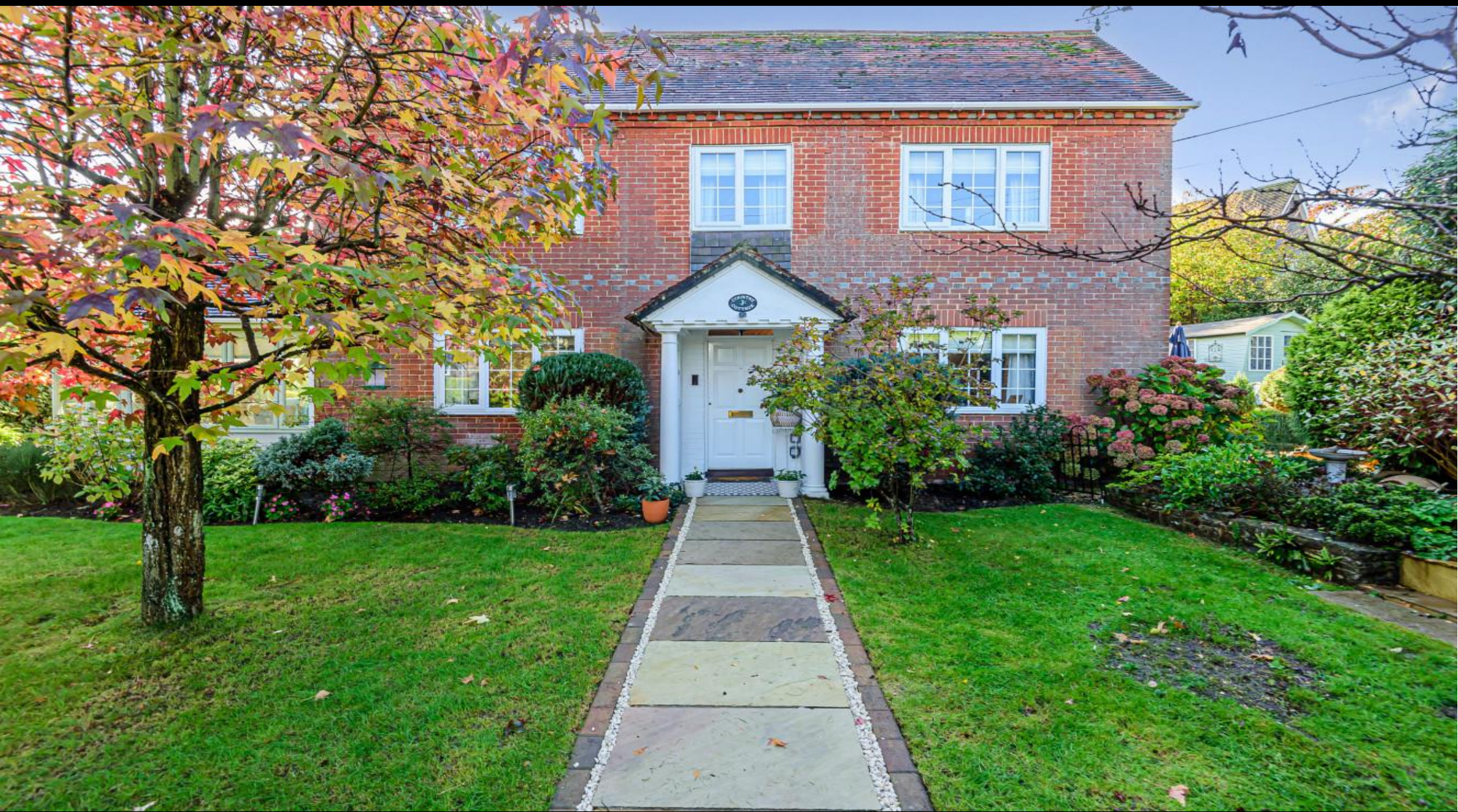
Romsey Road, Whiteparish, Salisbury, Wiltshire, SP5 2SD