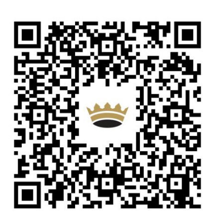
Scan the QR code to find out more information about this property.