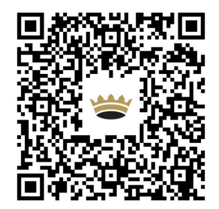
Scan the QR code to find out more information about this property.

Disclaimer Property Details: These particulars, whilst believed to be accurate are set out as a general outline only for guidance and do not constitute any part of an offer or contract. Intending purchasers should not rely on them as statements or representation of fact, but must satisfy themselves by inspection or otherwise as to their accuracy. We have not carried out a detailed survey nor tested the services, appliances and specific fittings. Room sizes should not be relied upon for carpets and furnishings. The measurements given are approximate. No person in this firms' employment has the authority to make or give any representation or warranty in respect of the property.