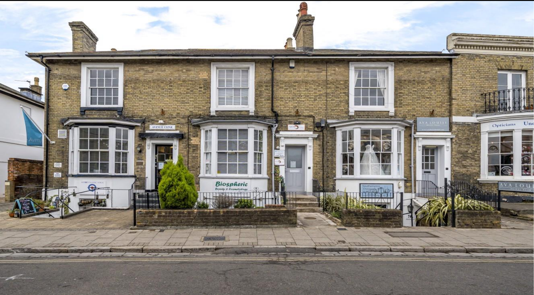
Bedford Place, Southampton, Hampshire, SO15 2DF