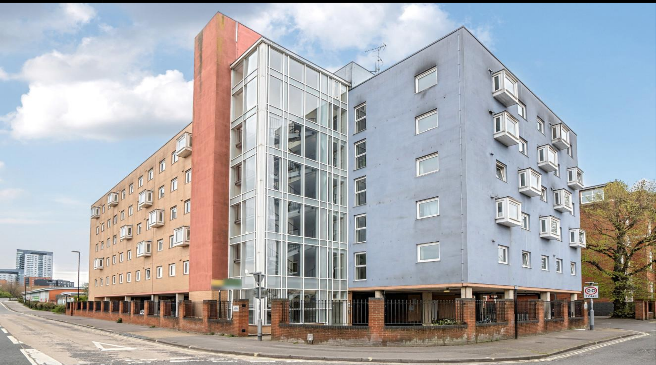
Anglesea Terrace, Southampton, Hampshire, SO14 5BL