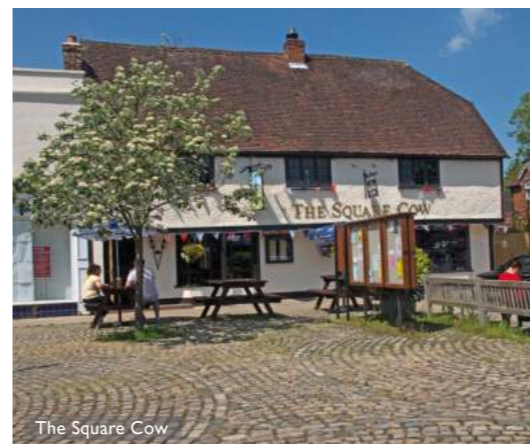
The Square Cow