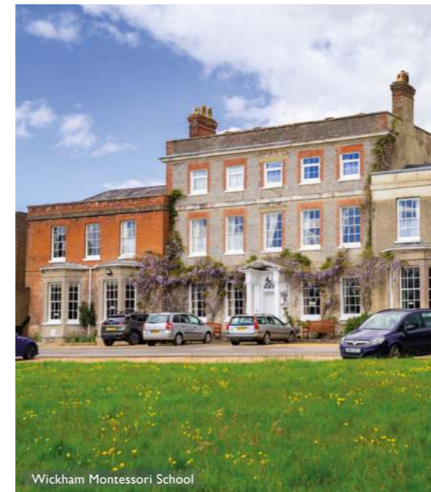
Wickham Montessori School

The many charms of village life are complemented by living within easy reach of vibrant cities and the South Coast, with London just an hour and a half away.