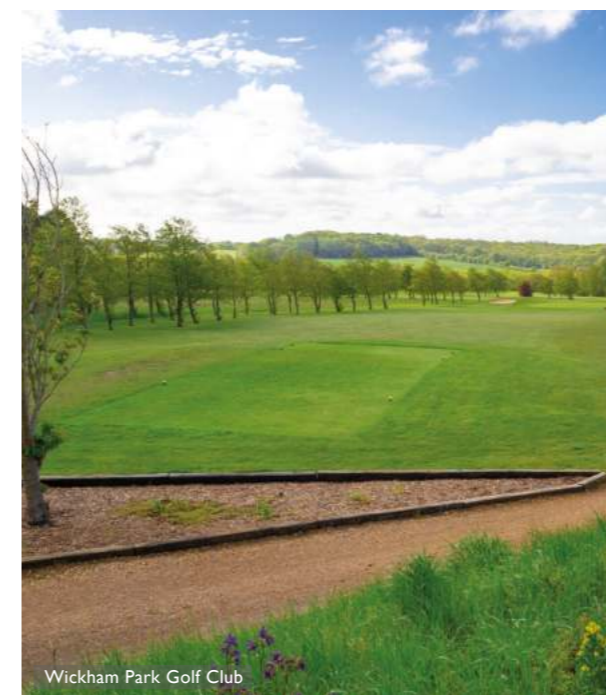
Wickham Park Golf Club