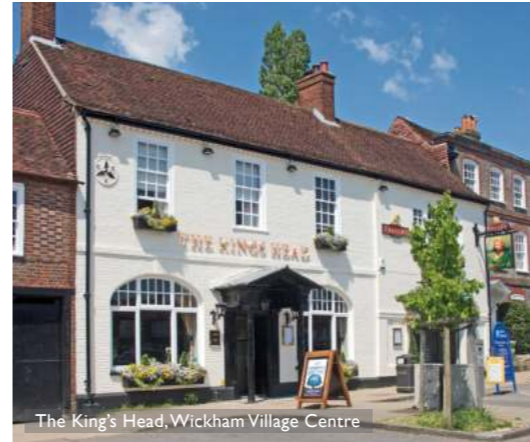
The King's Head, Wickham Village Centre