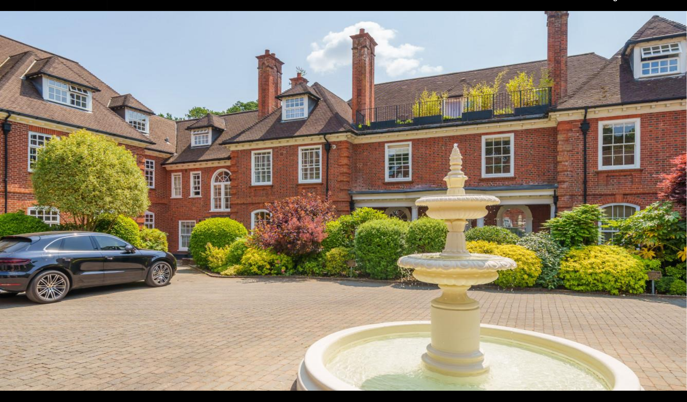
Bracken Place, Chilworth, Southampton, Hampshire, SO16 3ET