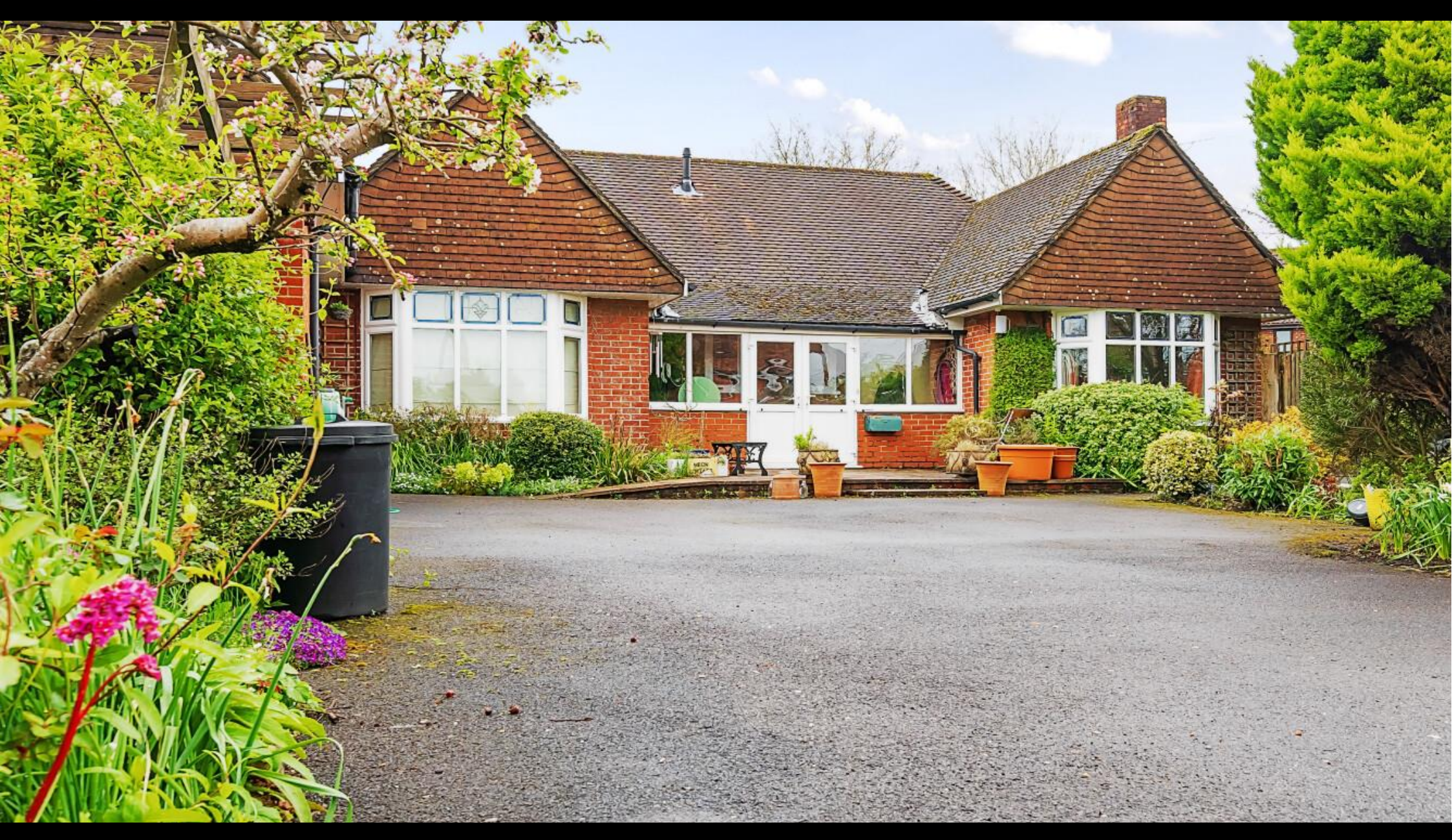
Church Road, Swanmore, Southampton, Hampshire, SO32 2PU