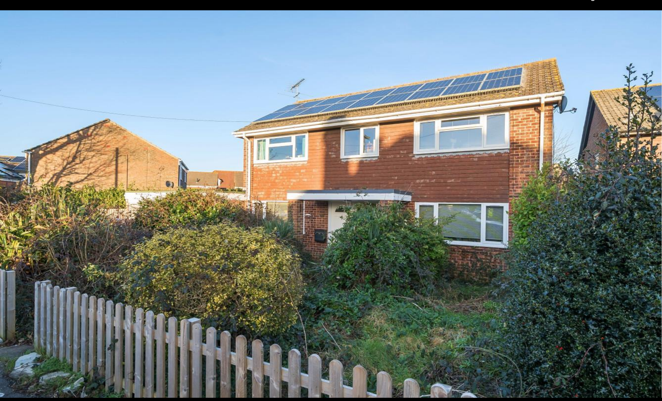
Church Road, Warsash, Hampshire, SO31 9GD