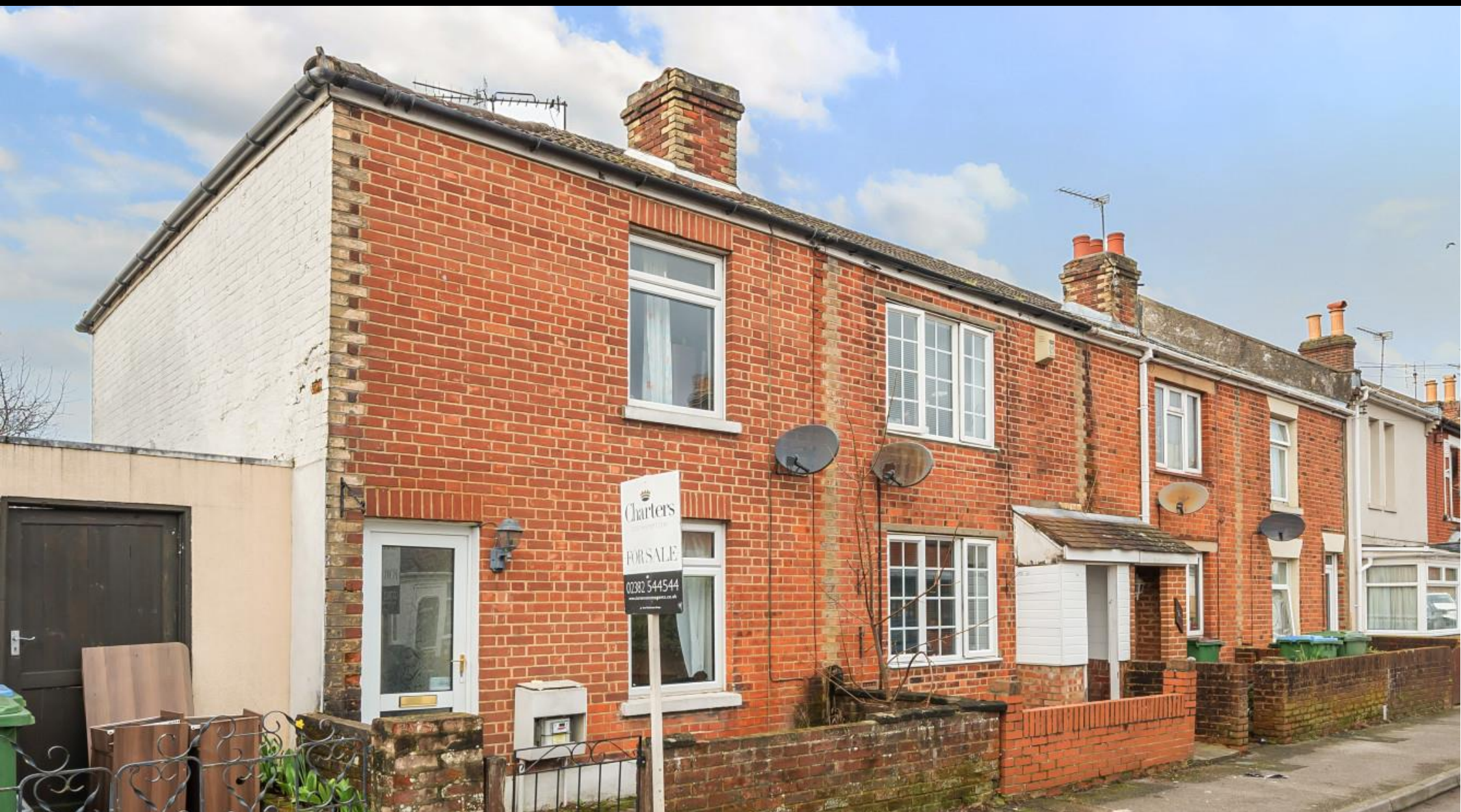
Firgrove Road, Freemantle, Southampton, Hampshire, SO15 3EP