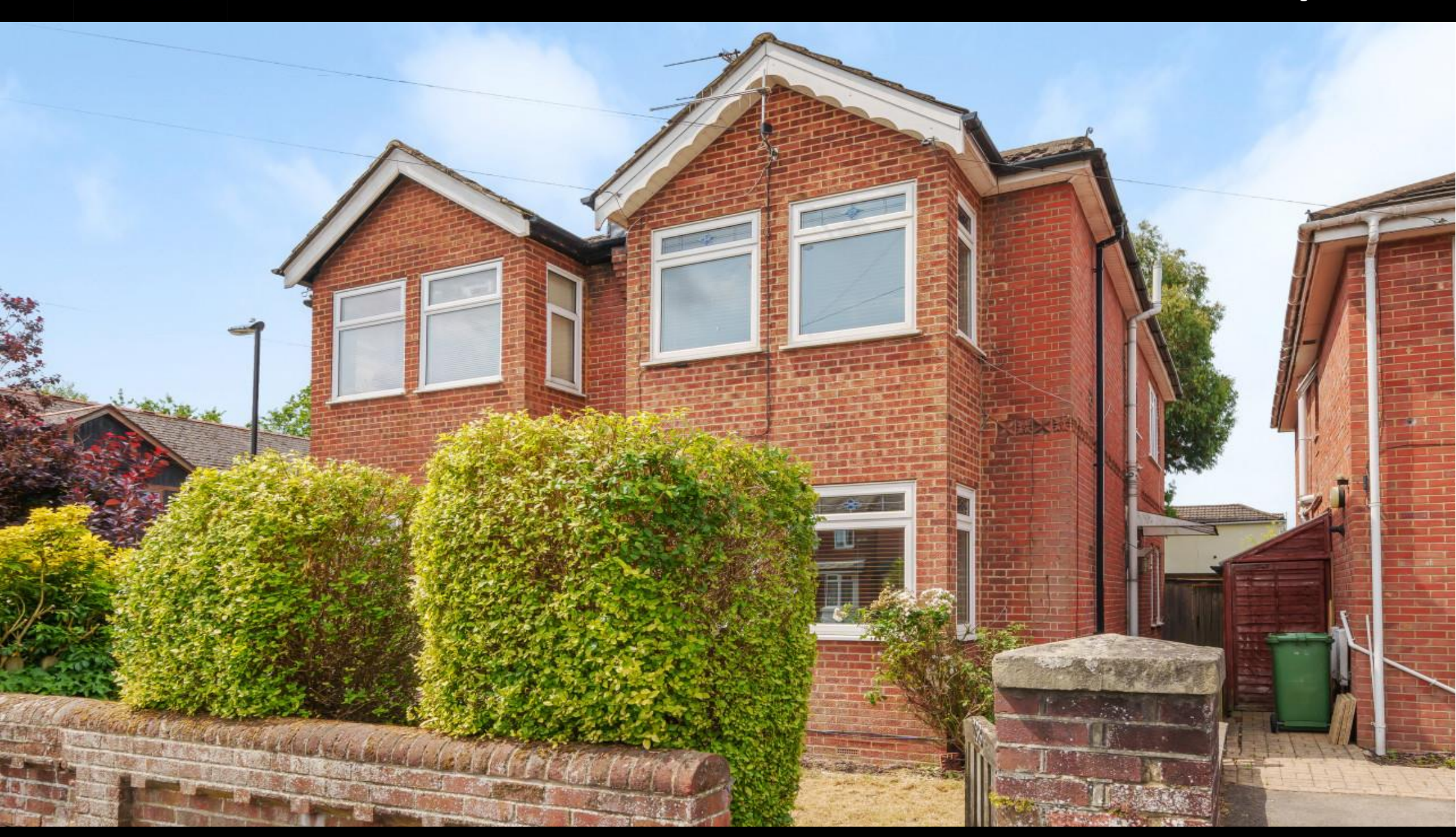
Foundry Lane, Shirley, Southampton, Hampshire, SO 15 3JQ