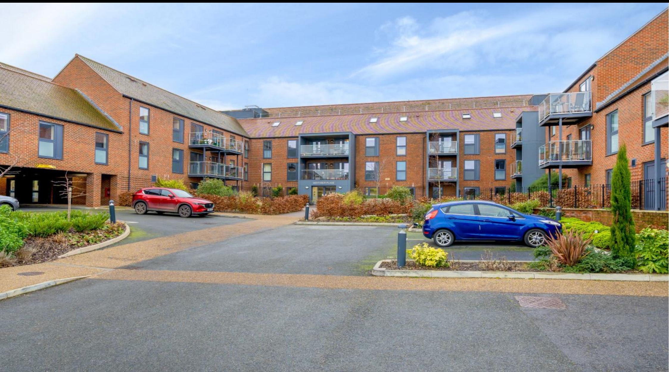
Wayfarer Place, The Dean, Alresford, Hampshire, SO24 9FT