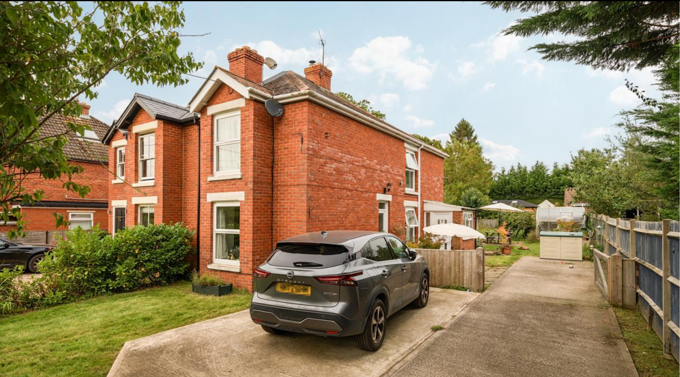
Forest Road, Waltham Chase, Southampton, Hampshire, SO32 2LA