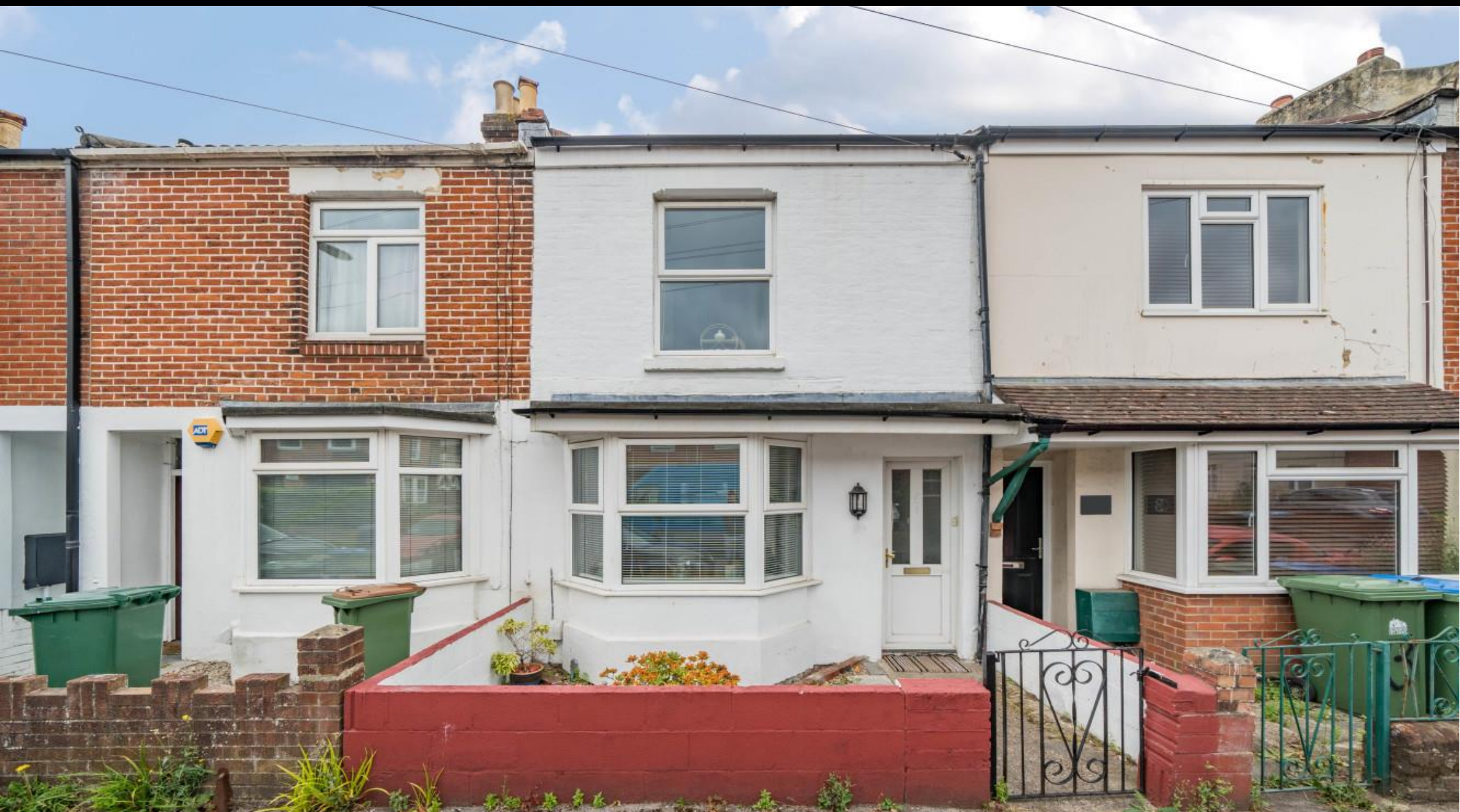
Adelaide Road, St Denys, Southampton, Hampshire, SO17 2HU