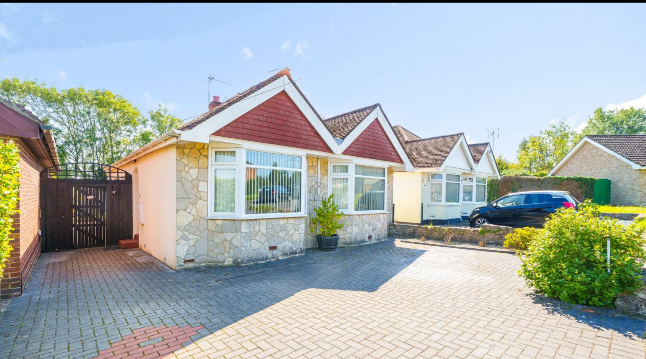
Belmont Road, Chandler's Ford, Eastleigh, Hampshire, SO53 3EU