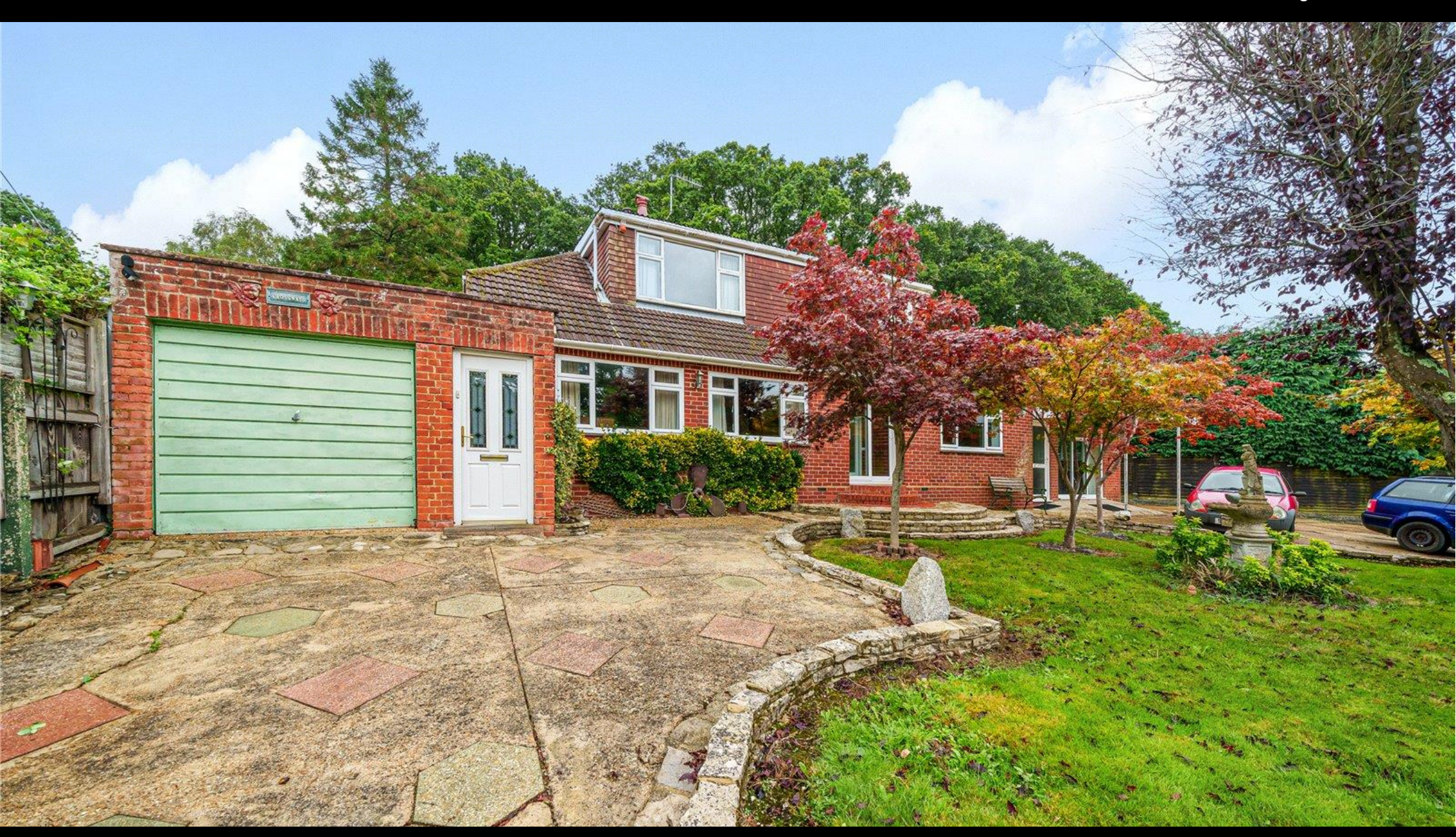
Newbridge, Cadnam, Southampton, Hampshire, SO40 2NW