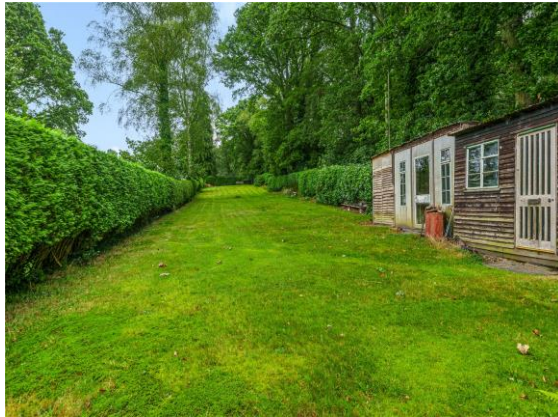
New Forest District Council Council Tax Band: F