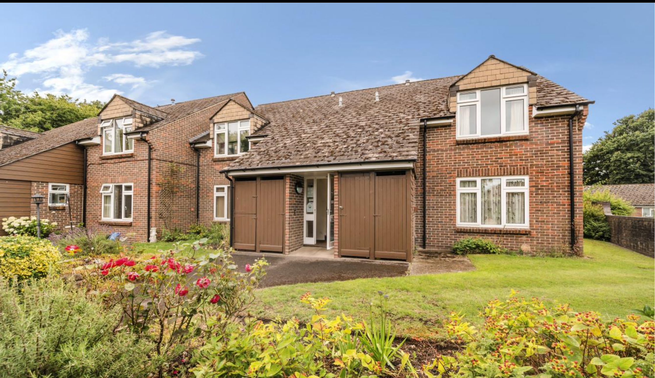
Gaskell Court, Thornton End, Holybourne, Alton, Hampshire, GU34 4HF