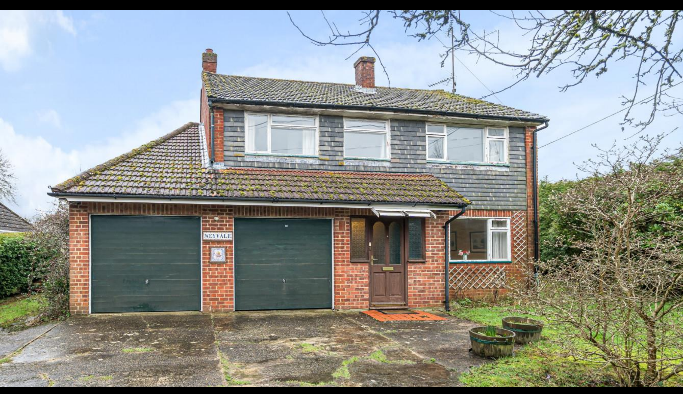
Binsted Road, Blacknest, Alton, Hampshire, GU34 4QD