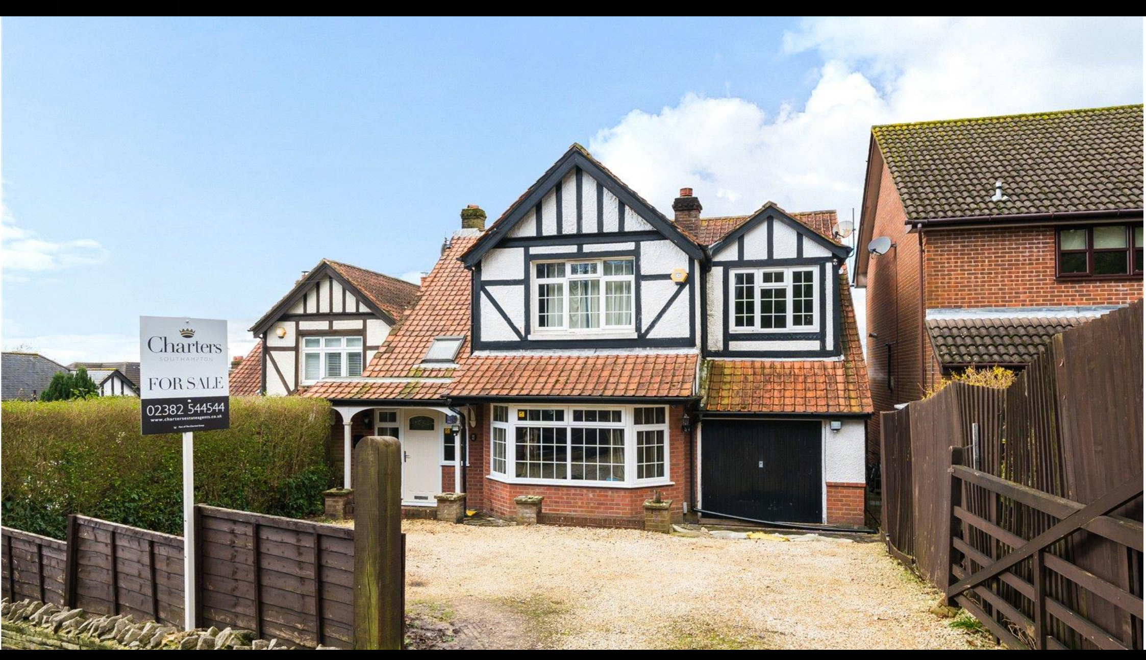
Midanbury Lane, Bitterne Park, Southampton, Hampshire, SO18 4HF