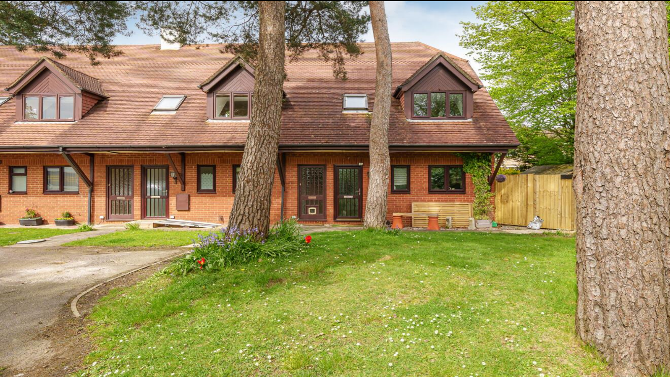
Bassett Wood Mews, 35 Bassett Crescent West, Bassett, Southampton, Hampshire, SO16 7DW