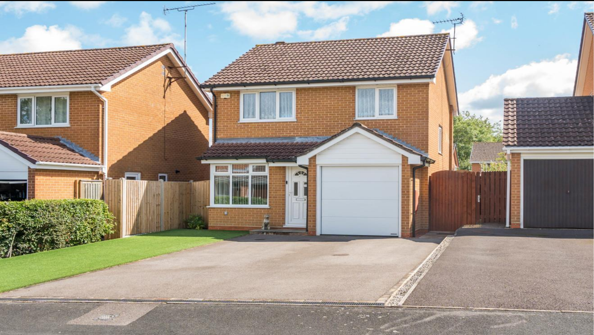
Valley Park, Chandler's Ford, Hampshire, SO53 3NY