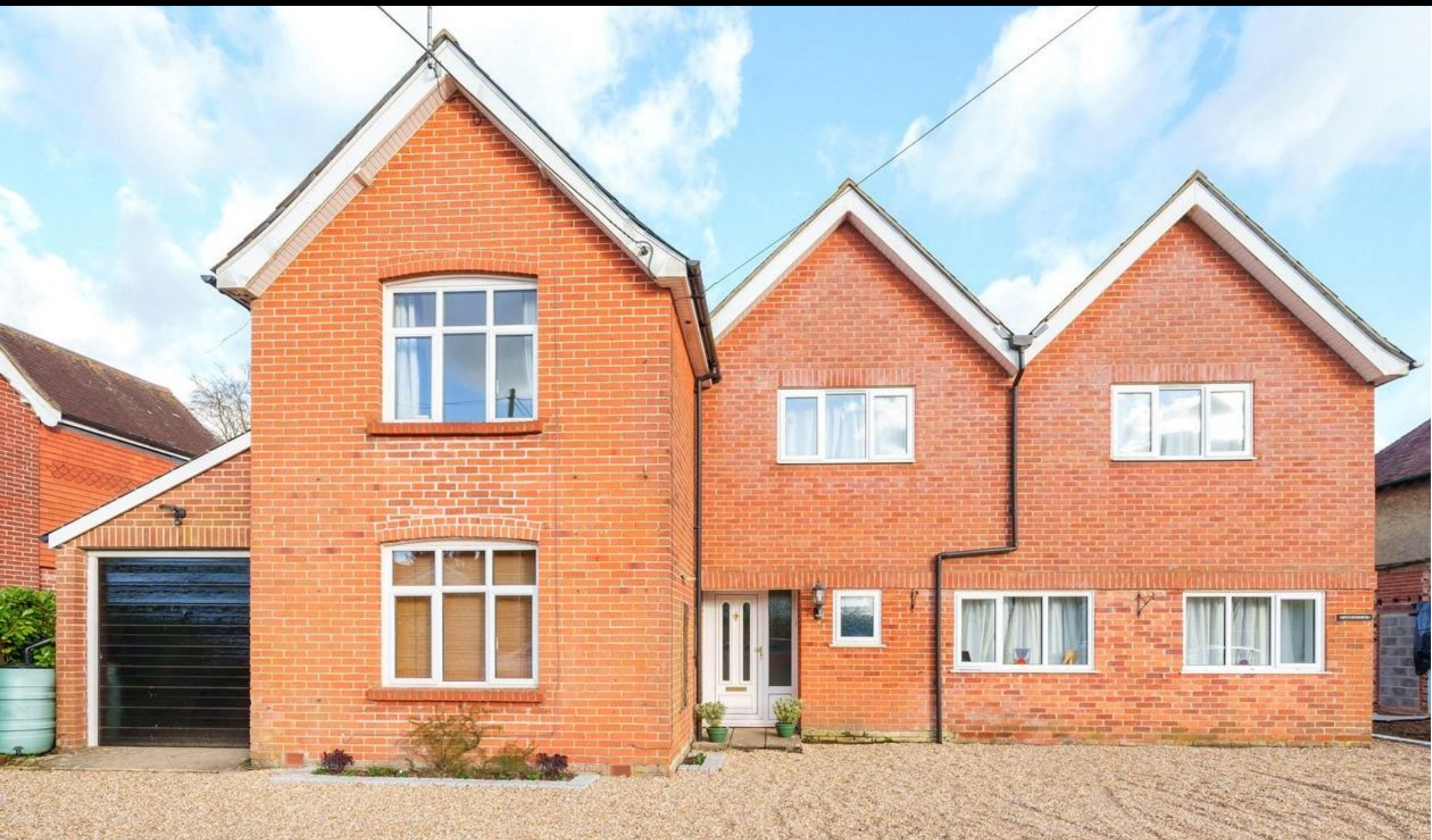
Danes Road, Awbridge, Romsey, Hampshire, SO51 0HL