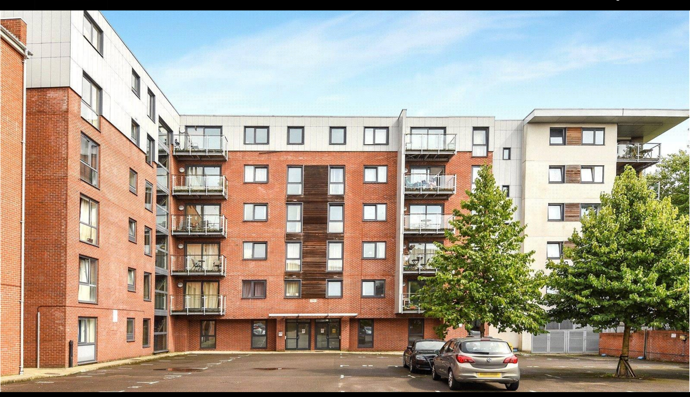
Castle Place, 117 High Street, Southampton, Hampshire, SO14 2EA